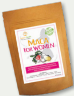
MACA FOR WOMEN