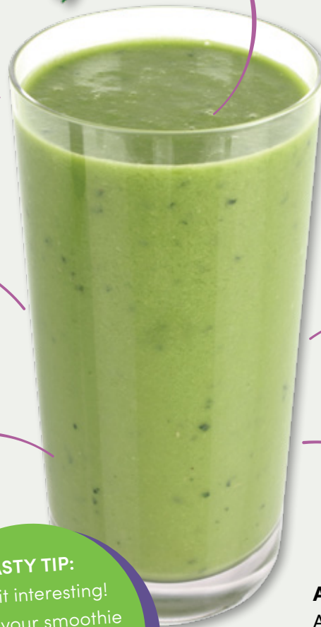
SPIRULINA OR 'GOOD GREEN STUFF'