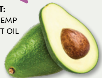
A GOOD FAT: AVOCADO, HEMP OR COCONUT OIL

TASTY TIP: Keep it interesting! Rotate your smoothie ingredients regularly to keep your taste buds satisfied!